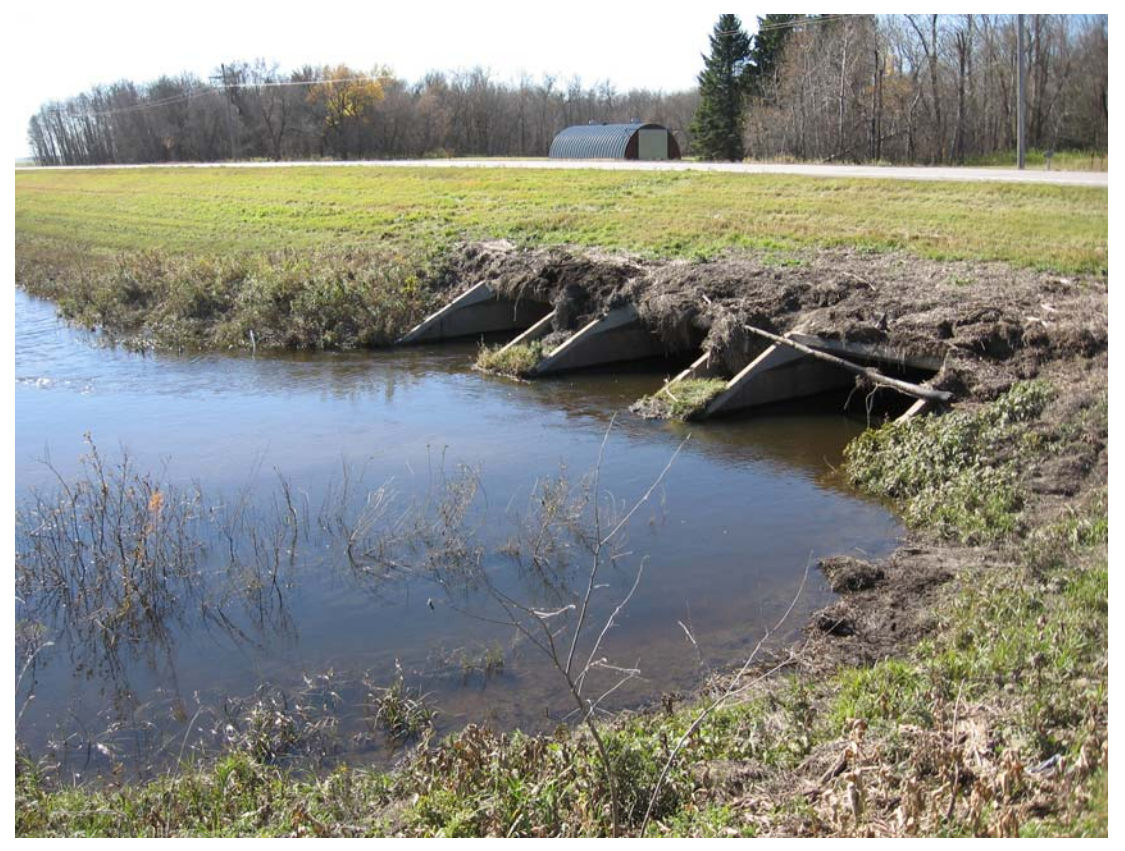
Debris piled on top of the culverts at the Hwy 54 crossing of the Moose River, indicating how high the water got in September.